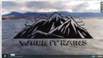
VIDEO CLIP PRODUCTION