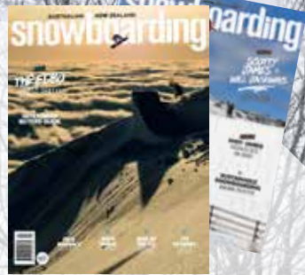
THE #1 SNOWBOARDING MAGAZINE X 2 ISSUES