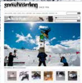
WEBSITE & WEEKLY NEWSLETTERS