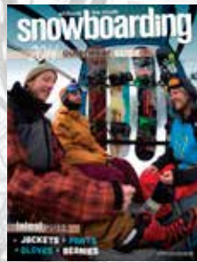
BOARD & OUTERWEAR BUYERS GUIDES