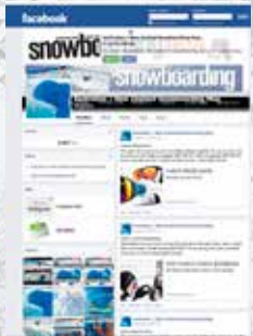
FACEBOOK & INSTAGRAM